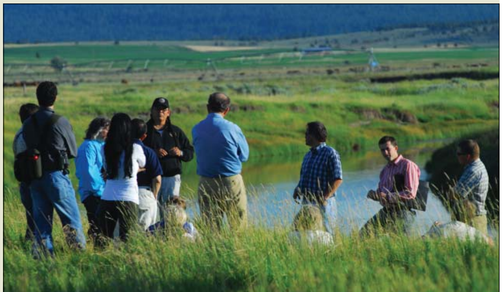
Sustainable Northwest partners, donors, and staff take in a field tour of the Yainix Ranch in Oregon's Upper Klamath River Basin.