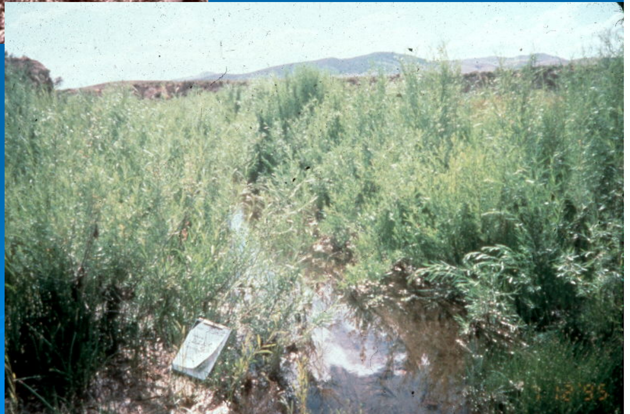
Dixie Creek NV 1995