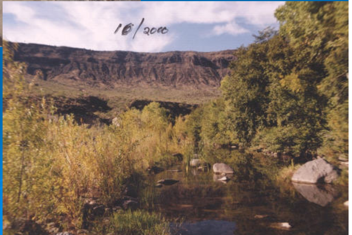
Burro Creek AZ 2000