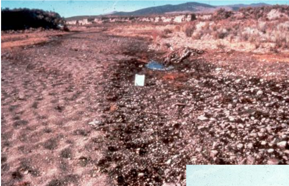
Dixie Creek NV 1989