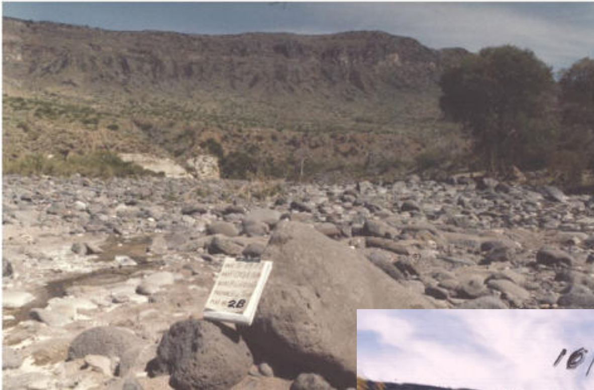
Burro Creek AZ 1981