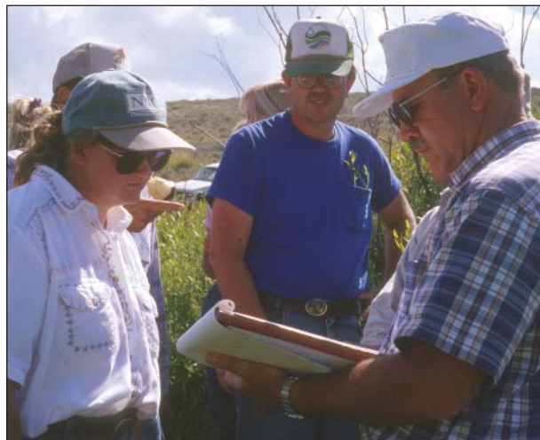
Needs a caption (text from slide: Interagency Participation in Montana)