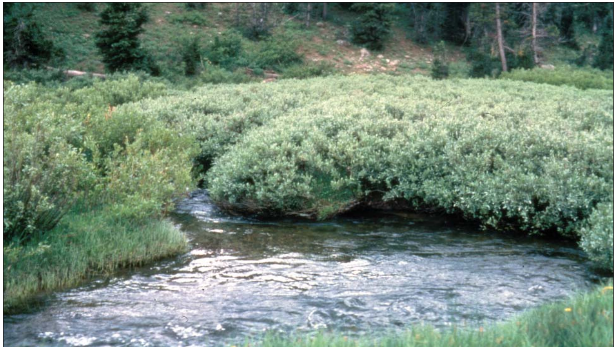
Needs a caption

more specific objectives, strategies, and activities. Combined, they reflect the recognition that while teaching riparian-wetland function to a broad spectrum of people is fundamental to meeting the goal of this strategy, additional emphasis must be placed on strategically building the individual, community, and institutional capacity needed to achieve coordinated management. Extended services will include activities that both precede and follow specific assistance. Additional focus on restoration, management, and monitoring will address a broader range of issues along with drawing on tools designed for situation assessment, conflict management, and consensus building. Emphasis will be placed on diversifying the existing skill base of the Riparian Coordination Network through training and recruitment from various disciplines, as well as from private organizations and communities. Finally, the revised strategy addresses program management and accountability by outlining specific activities that guide overall operations.