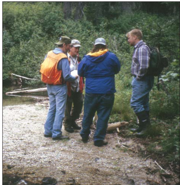
Words from slide: Trout Creek PFC Workshop, 9/5/02. Need a caption.

Each component of the Network has a specific role. The State Cadres work at the local level through coordinated outreach and education efforts occurring at various intervals throughout the year. Cadre members organize diverse groups of interested participants and teach the PFC assessment method to provide common terms and definitions designed to build understanding and foster effective communication. They also teach management applications and are available to provide problem-solving services. The agency Riparian Program Coordinators support the State Cadres and help integrate this cooperative approach within and across agencies, as well as with outside interests. The National Riparian Service Team functions full-time, over a broad geographic area, doing outreach and providing training and consulting services to diverse groups on a variety of issues relative to riparian-wetland resources. They also work to build support for the strategy by fostering communication among local, regional, and national levels and by integrating the strategy into national agency agendas.