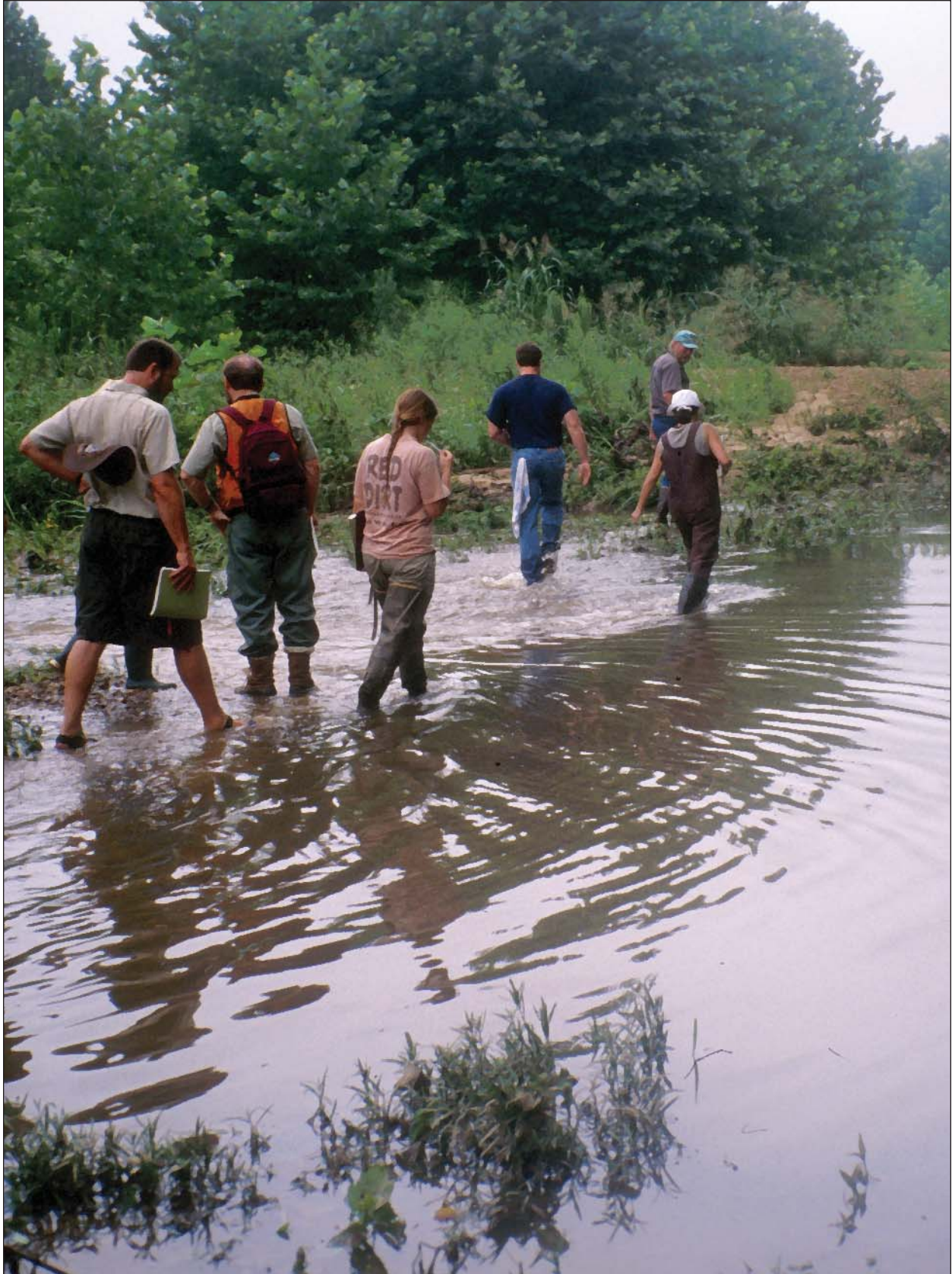
Need Caption. (slide text: Shawnee NE, Illinois, PFC Workshop)