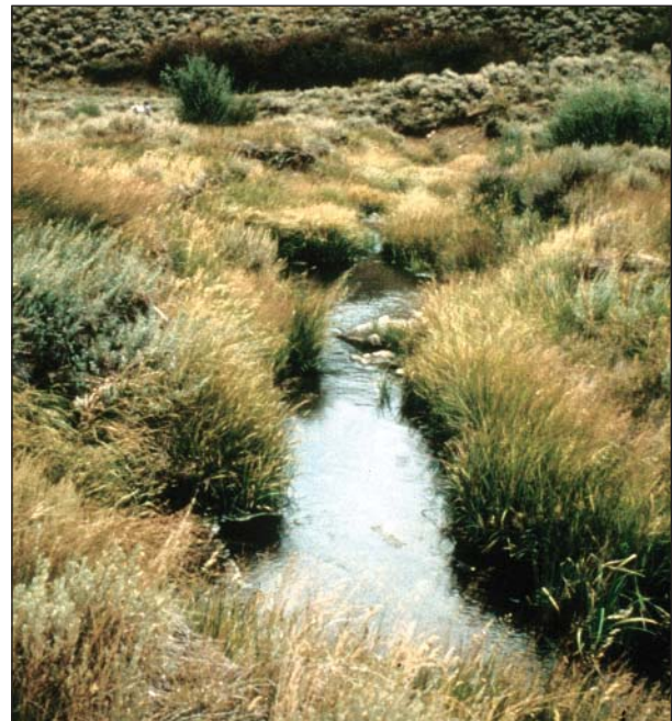
Caption goes here. Littlefield Creek, Wyoming 1987 and 1996.