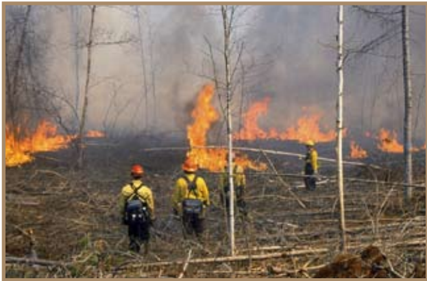
Both broadcast and “jackpot” burning were used as part of the Cedar Flats project's goal of restoring fire to the ecosystem.

The Whiskey South solicitation, for instance, gave “incentives” (the BLM term for rewarding the contractor for greater success) for “ utilization of biomass, post/poles, other minor forest products especially in support of the local community. . . ”