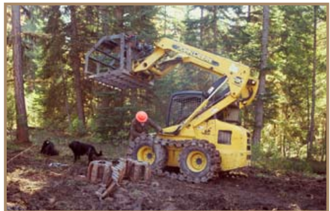
Equipment adjustments were made during an afternoon break in Hungry Horse to West Glacier Fuels Reductions activities on Flathead National Forest lands immediately adjacent to a number of homes in the wildland-urban interface.

Until more experience is acquired in using best value, the “best and final offers” submitted by offerors may be better thought out following discussions with the Contracting Officer than they would without the discussions.